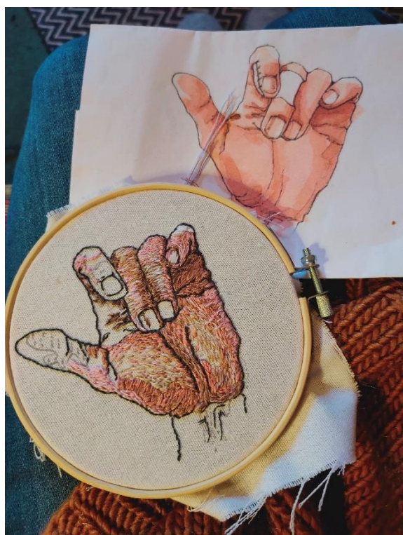
My embroidery of one of the drawings. Work in progress with some colour added using long and short stitch.

Please feel free to add a background pattern of your choice. Here, you can let your creativity take the lead! If you specialise in techniques such as goldwork or blackwork that require specific threads or beads, please let me know and I'll include them in your kit. A stamped addressed envelope will also be included, so that you can send the finished piece back to me at no cost to yourself.