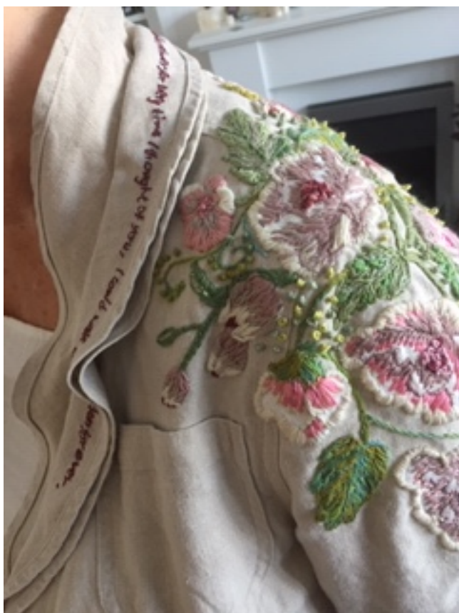
Examples of work created by members on this course.